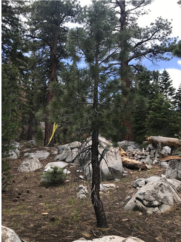
Photo 6 (Right): This photo was taken at 10,322 ft, looking east, near the highest point of the proposed trail as it traverses ESE, rising from Coldwater Canyon. This terrain would require heavy machinery, at the least, if not explosive blasting, to clear the large boulders.

Photo 5 (Left): This photo was taken at 8,543 ft, looking SSW, on the proposed trail that rises from the west side of Solitude Canyon up to the Sherwin Crest. It shows a marked tree that is surrounded by large boulders and fallen trees.