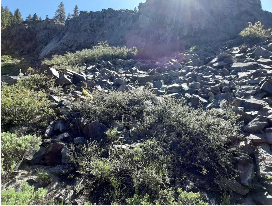
Photo 2: This photo was taken at 9,409 ft, looking North, along the proposed trail that would connect from Lake Mary to the portion of the trail running from Coldwater Canyon up to the Sherwin Crest. It shows another steep and unstable talus field with large rocks.

Photo 1: This photo was taken at 9,199 ft, looking North, near the top of the first set of switchbacks, along the proposed trail that rises from Coldwater Canyon up to the Sherwin Crest. It shows a steep and unstable talus field with large rocks.