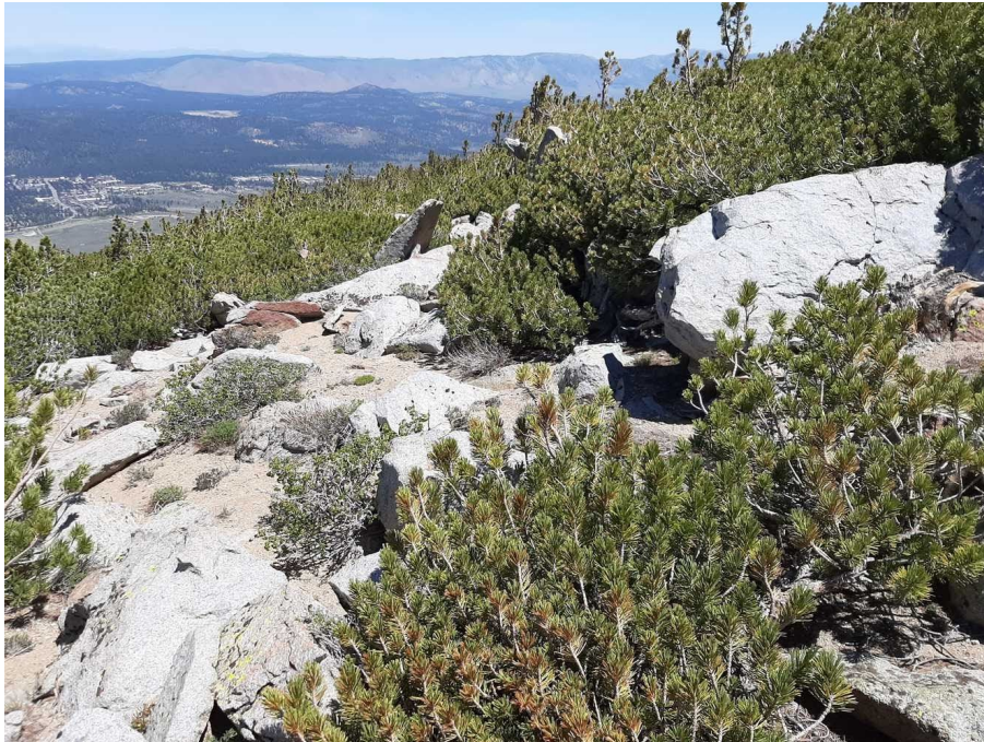
Photo 8: This photo was taken at 9,045 ft, looking northeast, shows where the first set of switchbacks that rise from Coldwater Canyon would be. The terrain is very steep and the loose talus is very unstable and prone to slide.

Photo 7: This photo was taken at 10,318 ft looking northwest, near the highest point of the trail as it traverses ESE, rising from Coldwater Canyon. This terrain would also require heavy machinery, at the least, if not explosive blasting, to clear the large boulders.