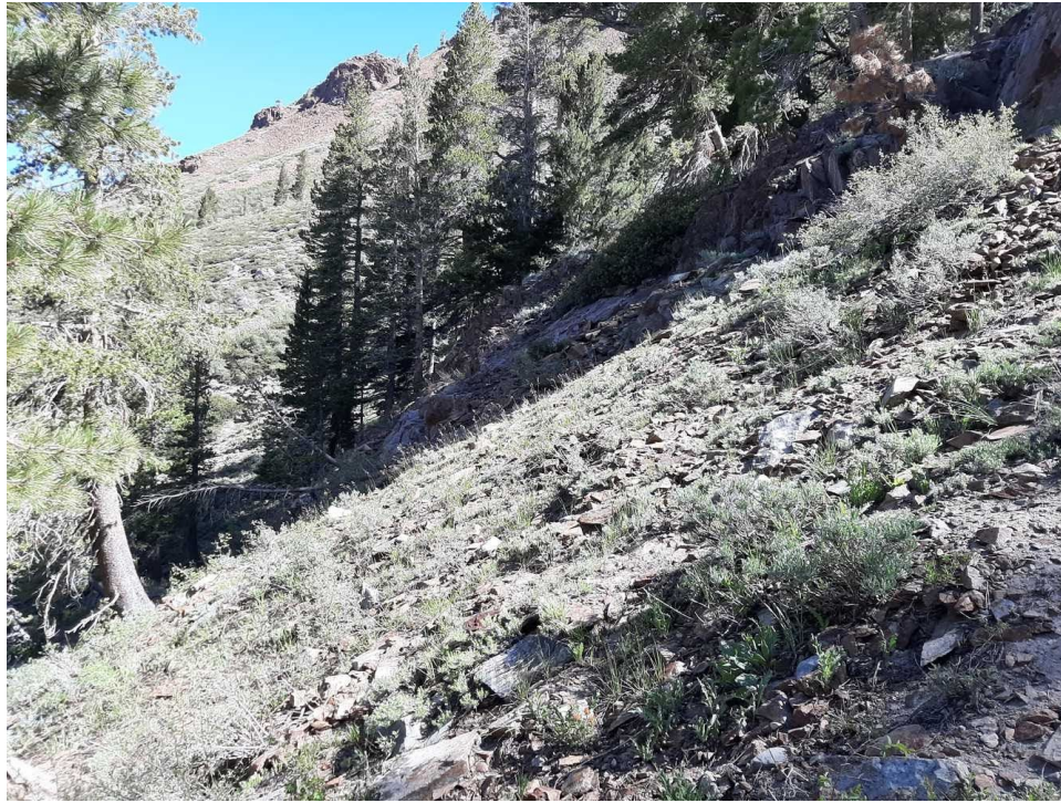
Photo 4: This photo was taken at 10,131 ft, looking northwest, where the proposed trail begins to traverse southeast. It shows large rocks scattered through the trees and across a steep, open slope.

Photo 3: This photo, looking north, was taken at 9,078 ft on the proposed trail as it rises from Coldwater Canyon. It shows a steep, rugged slope with loose talus, rocks and large boulders protruding from the soil, posing significant issues for trail construction, and safety issues for trail users.