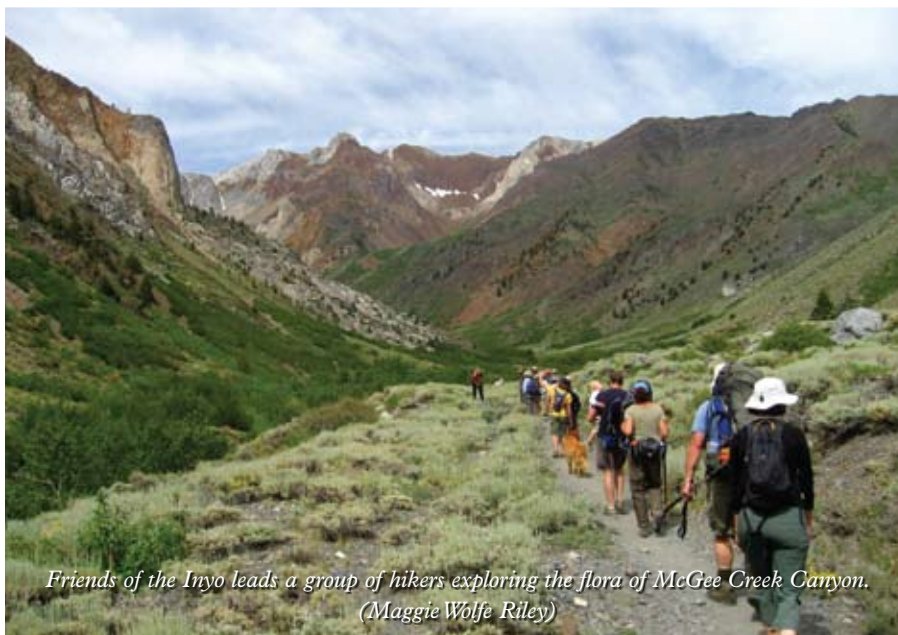
Friends of the Inyo leads a group of hikers exploring the flora of McGee Creek Canyon.