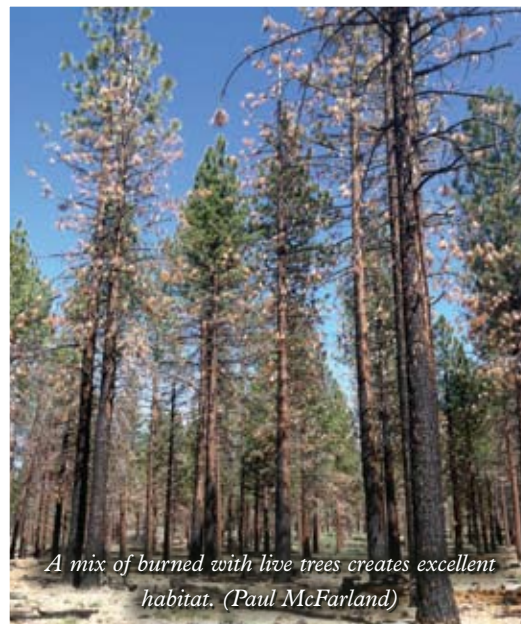
A mix of burned with live trees creates excellent habitat. (Paul McFarland)