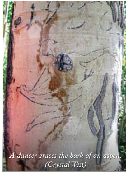
A dancer graces the bark of an aspen.

I feel fortunate to have stumbled upon a piece of the rich array of art left by the many cultures who have lived on this land or have just passed by. Petroglyphs, pictographs, and arborglyphs found in this area are distinctive reminders that we all share this uniquely human tradition of leaving our stories in stone and wood. My dog nudges me signalling that its time to go. I see the shimmer of a silver umbrella far ahead. I look one last time at the painted handprints and say thanks for reminding me of the ones who have passed here before.