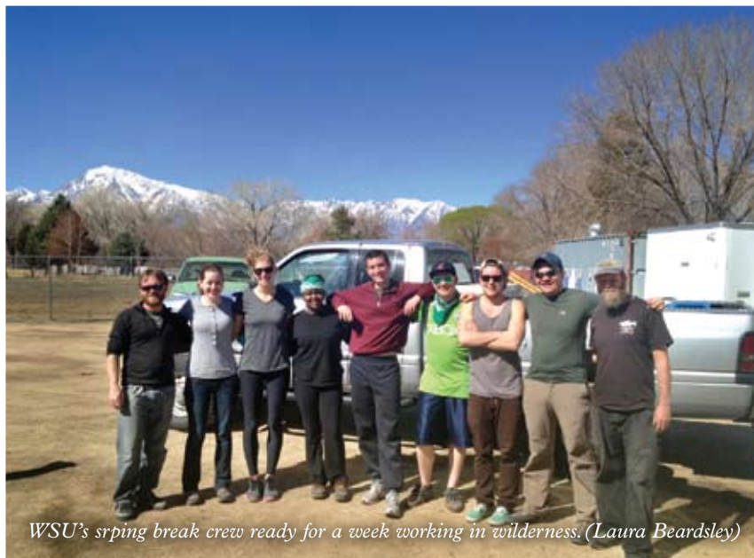
WSU's spring break crew ready for a week working in wilderness.

Finally, not to be outdone by Earth Day, we celebrated National Trails Day in similar style with three events across the Eastern Sierra. Volunteers worked in Black Canyon, in the White Mountains, and a group of curious kids searched for lizards and snakes in the Tungsten Hills. In Mammoth, more than 50 people helped re-build biking and hiking trails around Panorama Dome as part of the first Summer of Steward-