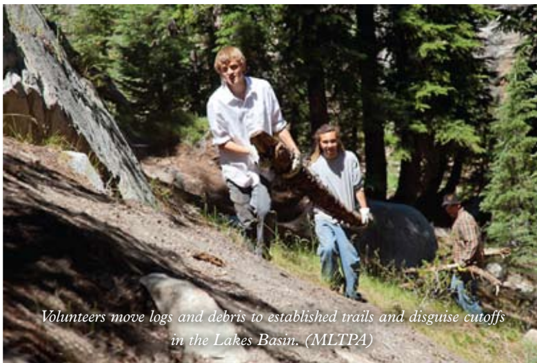
Volunteers move logs and debris to established trails and disguise cutoffs in the Lakes Basin. (MLTPA)

By 1881, harsh winters, fires, and lack of production at the mines left hardly anyone at Mammoth City, in what is now known as the Mammoth Lakes Basin. It wasn't until the early 1900s that pioneers came back to settle more permanently in the Mammoth area, and many chose the more hospitable meadows of Old Mammoth. The Wildasinn Hotel