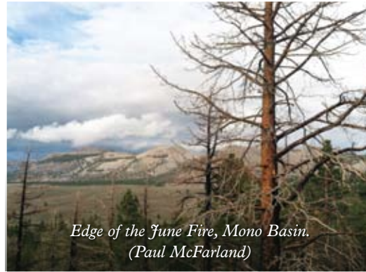
Edge of the June Fire, Mono Basin.

Our low- and mid-elevation forests are thus said to be in a condition of fire deficit, meaning they have missed one to several cycles of burning that would have occurred in the absence of fire suppression. As a result, when fires inevitably occur, they burn at a much higher sever-