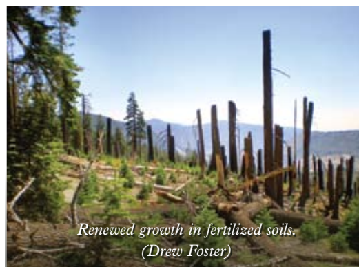
Renewed growth in fertilized soils. (Drew Foster)

ity than is typical. The recent high-severity, stand-replacing fires in Jeffrey pine forests in the Mono Basin are excellent examples.