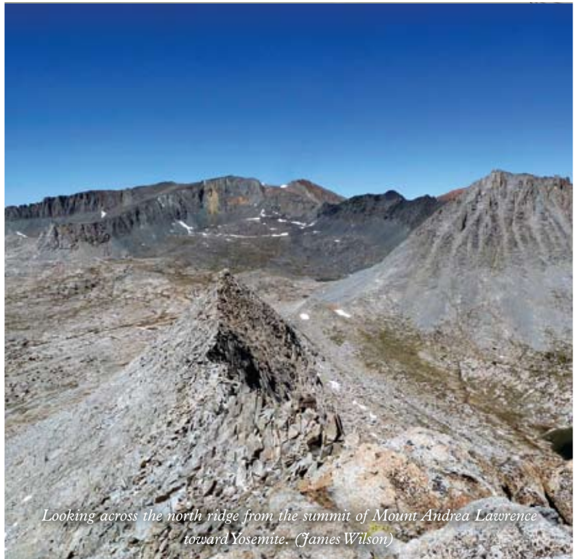
Looking across the north ridge from the summit of Mount Andrea Lawrence toward Yosemite.

Friends of the Inyo has also been working with Mono County and the National Park Service as part of a committee planning trails in an around Lee Vining. The committee's goal is to create a plan for a network of trails in the Lee Vining area with the potential of one day establishing a trail connecting the community and campgrounds of Lee Vining to Yosemite National Park.