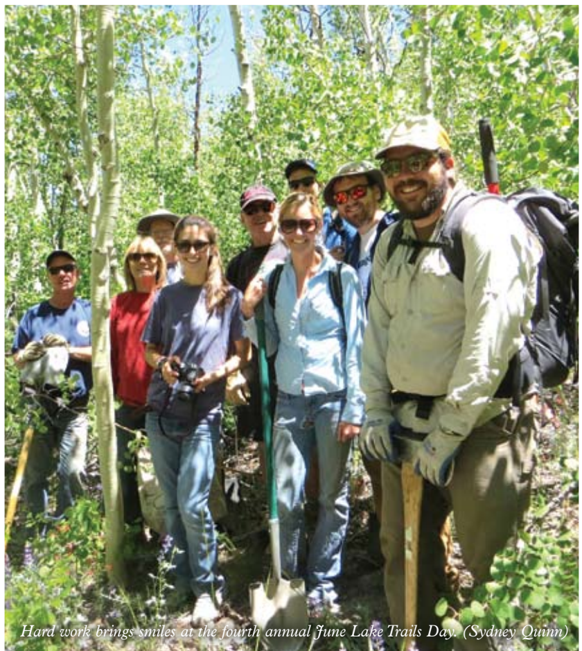
Hard work brings smiles at the fourth annual June Lake Trails Day.