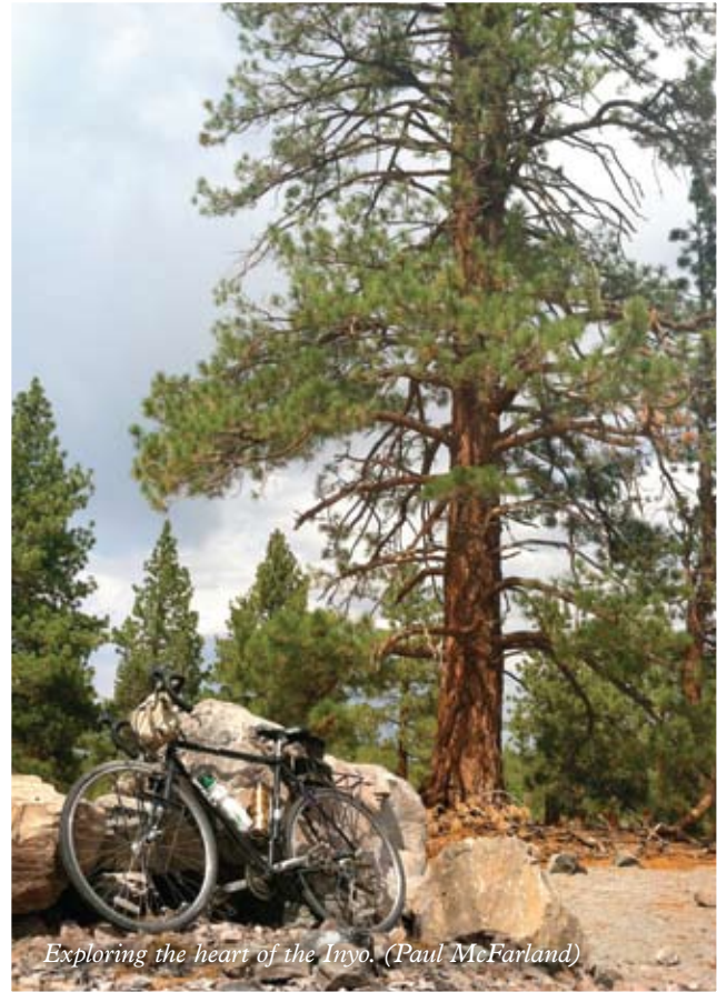
Exploring the heart of the Inyo. (Paul McFarland)

It'd be easy to rattle off a list of recommended places with flowery descriptions of what's to be seen with detailed directions on how to get there, but this forest is one to discover on your own. Spend some time with a good map (or even a bad one), draw out a loop or throw a bottle cap down to pick a spot. Or, like I find myself doing, pull off the highway, shut off the radio and listen to the trees and woodpeckers tell you where to go. They know this place; they've been here, at the heart of the Inyo National Forest, for a long time.