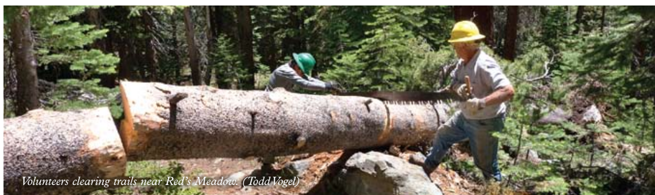
Volunteers clearing trails near Red's Meadow.

Friends of the Inyo's annual members' weekend complete with a meaningful stewardship project in honor of National Public Lands Day, hikes, and a celebration of Friends of the Inyo and our amazing members. We've got some great surprises in store. Stay tuned for more information, and come spend a night in the Sierra with us.